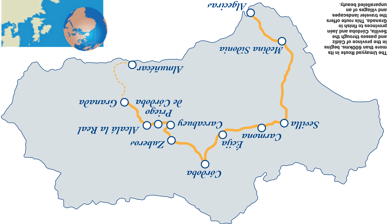
MAP OF THE Umayyad ROUTE IN ANDALUSIA